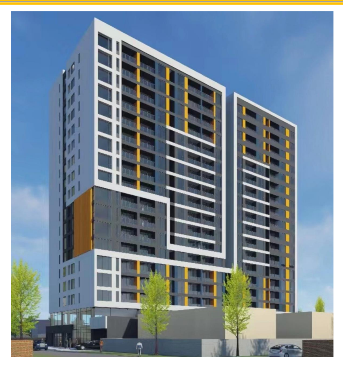
Executive Luxury Homes

(1Br + study room, 2Br all ensuite, 2Br + study room, 2Br + DSQ)